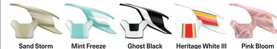
Sand Storm Mint Freeze Ghost Black Heritage White III Pink Bloom