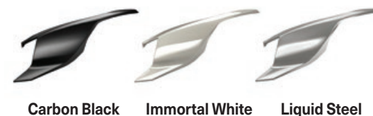
Carbon Black Immortal White Liquid Steel