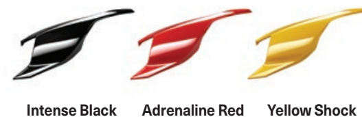
Intense Black Adrenaline Red Yellow Shock